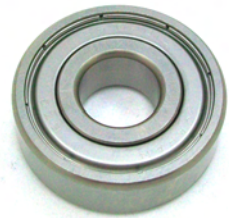
(not actual bearing)