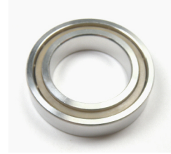
(for illustration only)