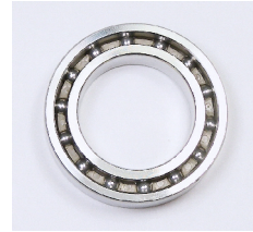
(for illustration only)