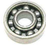
(for illustration only)