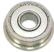
(not actual bearing)