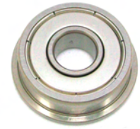
(not actual bearing)