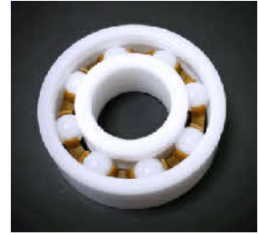
(for illustration only)