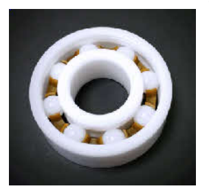
(for illustration only)