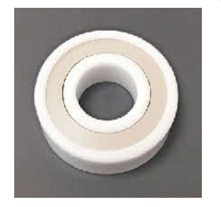
(for illustration only)