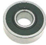
(not actual bearing)