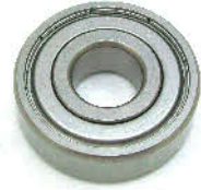
(for illustration only)