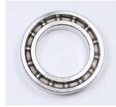
(for illustration only)