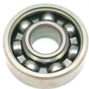
(for illustration only)