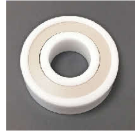
(for illustration only)