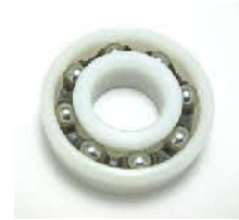
(for illustration only)