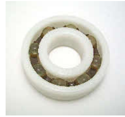
(for illustration only)